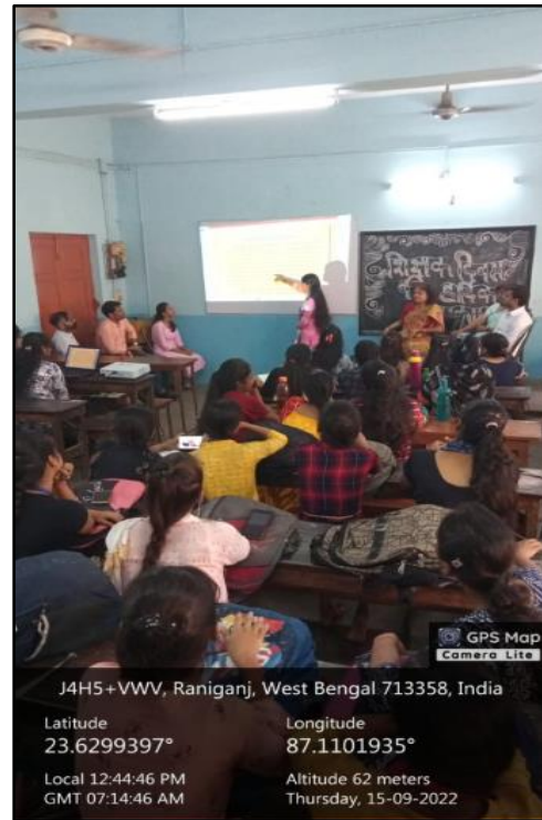
Presentations being made by students